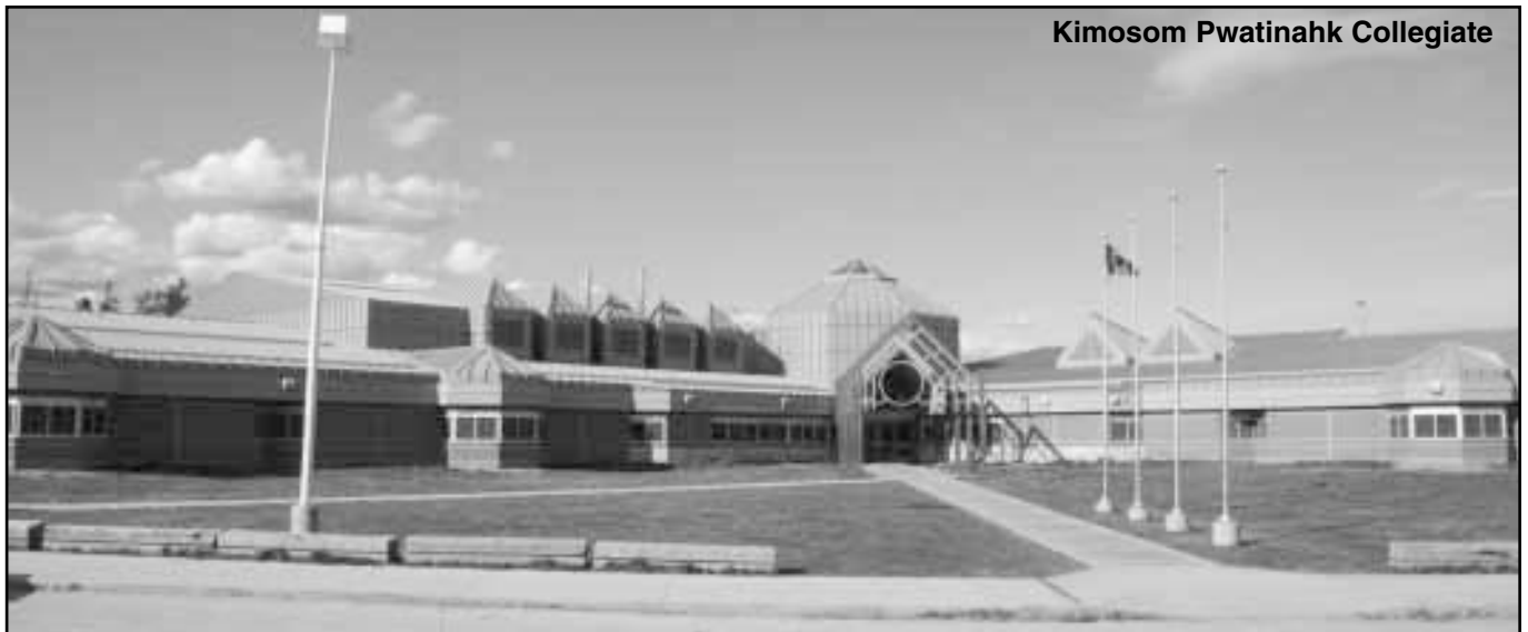
Kimosom Pwatinahk Collegiate