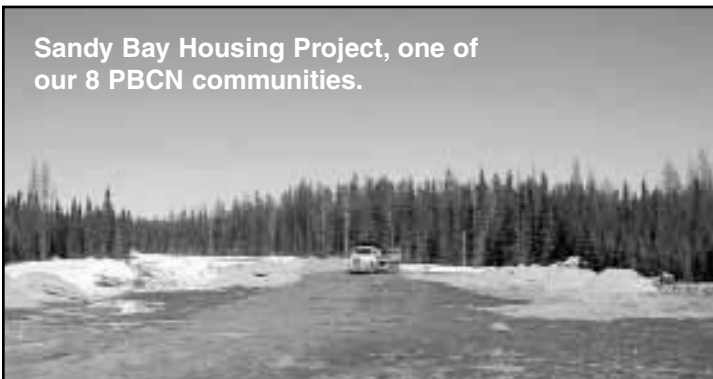
Sandy Bay Housing Project, one of our 8 PBCN communities.