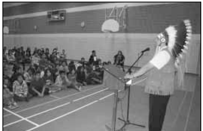
Chief talking to kids at school

We will have more community based reports for the next edition of the newsletter.