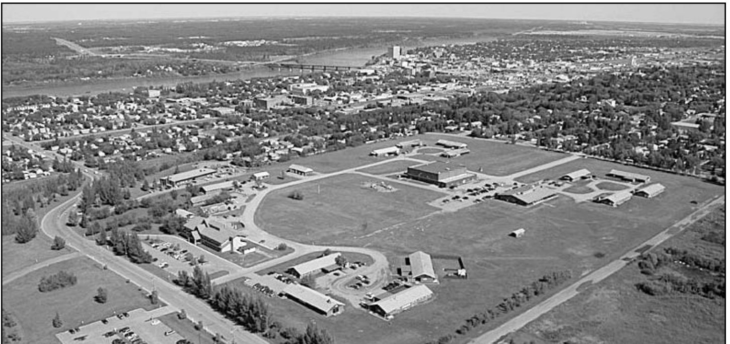
Prince Albert Urban Reserve