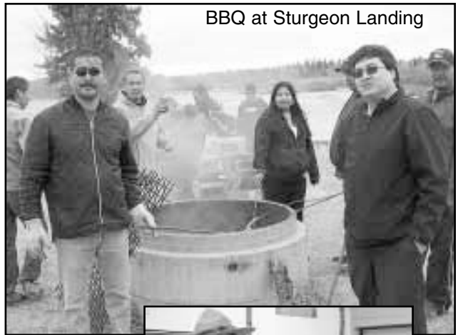
BBQ at Sturgeon Landing